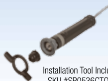
Installation Tool Included SKU #SP0536CT00L