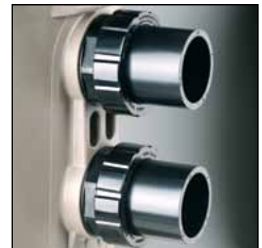
CPVC Union Connections