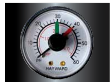
Pressure and Cleaning Gauge