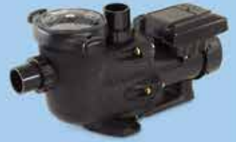
Also available in model that connects directly with Hayward® controls (SP3202VSPND).

The intuitive control interface rotates to four positions on the pump, so it's always easy to read and operate.