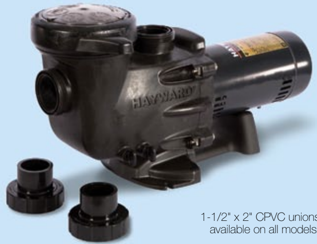
1-1/2" x 2" CPVC unions available on all models.

Max-Flo II provides exceptional value by building upon the outstanding reputation of the original through updated features such as CPVC unions, an elevated motor base and a larger leaf holding capacity strainer basket. For a great pool experience every time, count on Max-Flo II.