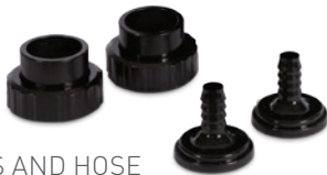
UNIONS AND HOSE BARB ADAPTERS

With 1½" union fittings, the Hayward Booster Pump is easy to install and remove. Its ¾" hose barb union adapters and flexible hose make retrofitting in existing pool pads simple.